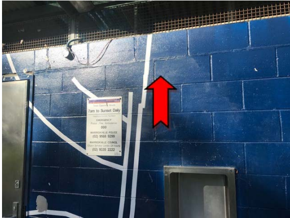
Photo 1. Exterior, throughout, walls - suspected lead-containing blue upper paint system.